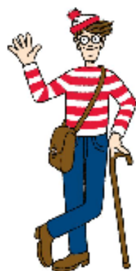
WHERE'S WALLY - Mini Games